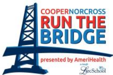
For the 2 nd year, the HMGS Team had a great time running and walking for a good cause and handing out sunscreen at the Cooper-Norcross Bridge run!