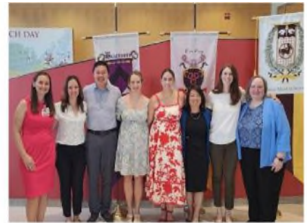
GME Graduation CMSRU Camden, NJ