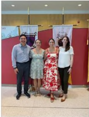
Class of 2024